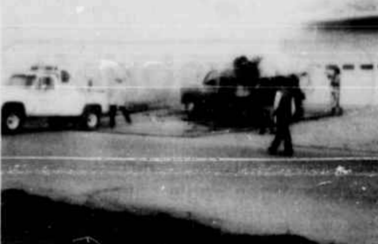
The burning bale of hay is being put out at the fire station after the driver of the pickup noticed it was on fire and drove to the station.